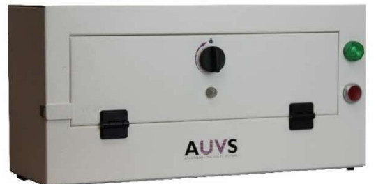
The UV Box - Quickly becoming the healthcare standard in non-chemical disinfection of mobile handheld devices.