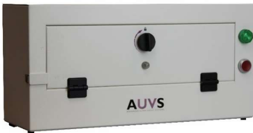
The UV Box - Quickly becoming the healthcare standard in non-chemical disinfection of mobile handheld devices.